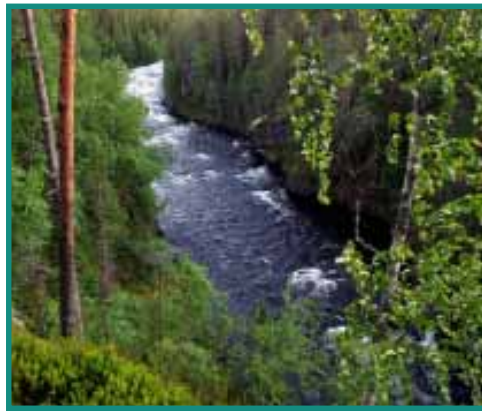
We will make a trip by rubber raft.